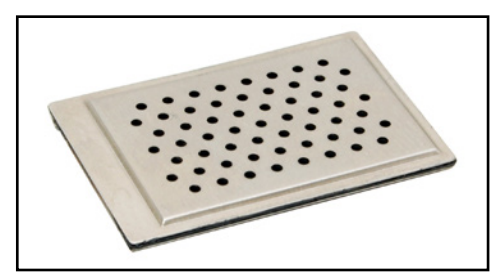
Featured Product: MLCT Series

You know Transducers USA is your premier source for beepers, buzzers, transducers, sirens and alerts. But did you know that we also specialize in speakers for all your small device applications?