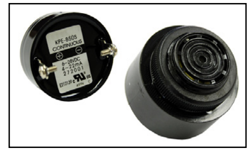
KPE-850S Panel Mount Buzzer

TUSA's KPE-850S Panel Mount Buzzer is the most popular in our series of UL-approved, panel mounted audio alerts. It is a continuous DC-driven unit. In addition, we offer it in slow or fast pulse and AC/DC up to 250 volts. Sound output can be adjusted by adding a shutter control. Available terminations are screw-type, .250 spade or wire leads.